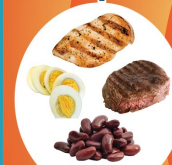
Meat and meat alternatives