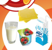
Milk and milk products