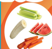
Vegetables and fruit

Snacks are 'mini meals' and should come from the four food groups.